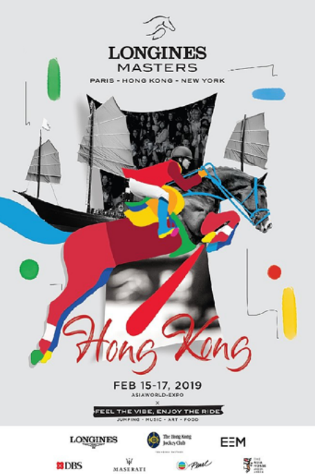
Feb. 15-17, 2019 Asiaworld Expo

LONGINES EEM AND COMPANY COMPANY COMPANY