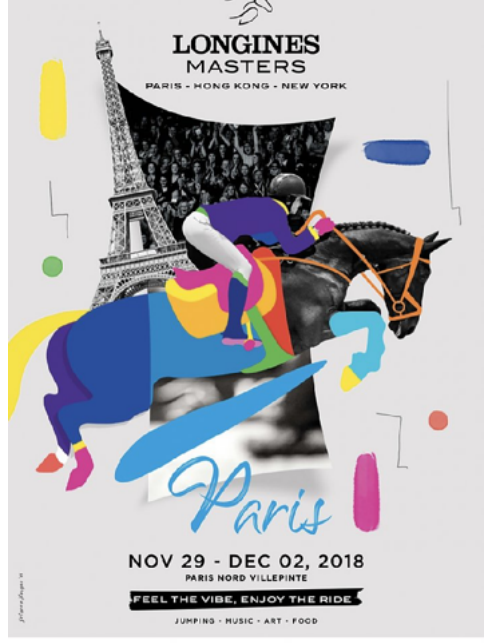
Nov. 29 - Dec. 2, 2018 Paris Nord Villepinte

LONGINES EEM AND COMPANY COMPANY COMPANY